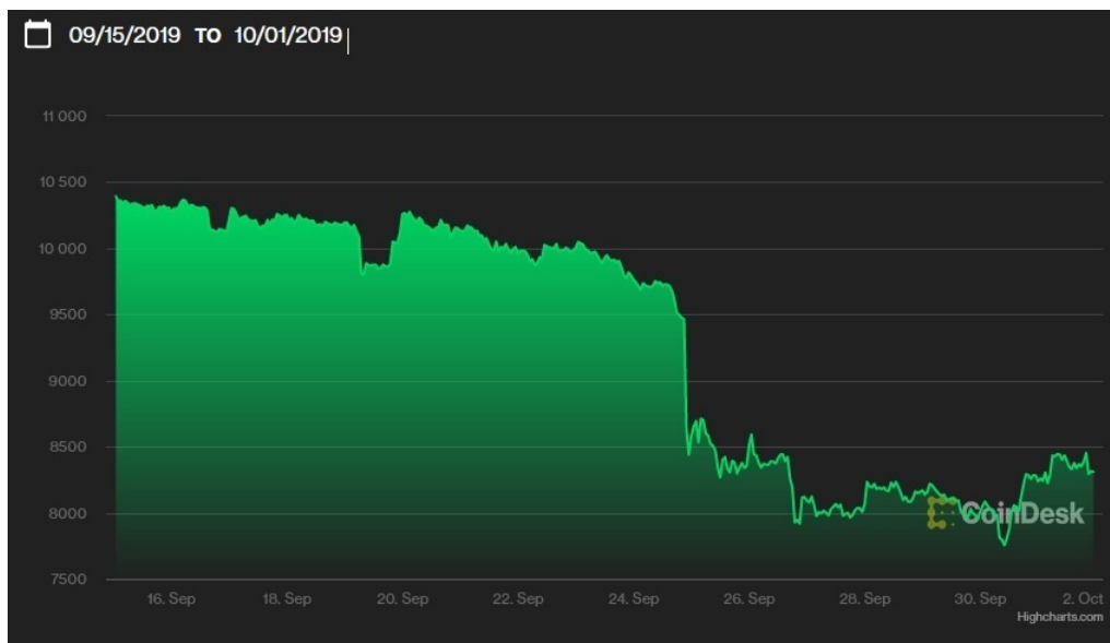
Figure 1: The price of bitcoin in a period of 4 weeks around 23.9.2019.

impact; for example, following the media attention surrounding the leaking of the supremacy claims around September 22, 2019, the value of bitcoin (and other digital currencies) sharply dropped by more than 10% and it is a reasonable possibility that given the potential effects of quantum computers on the safety of digital currencies, the quantum supremacy claims caused this drop.