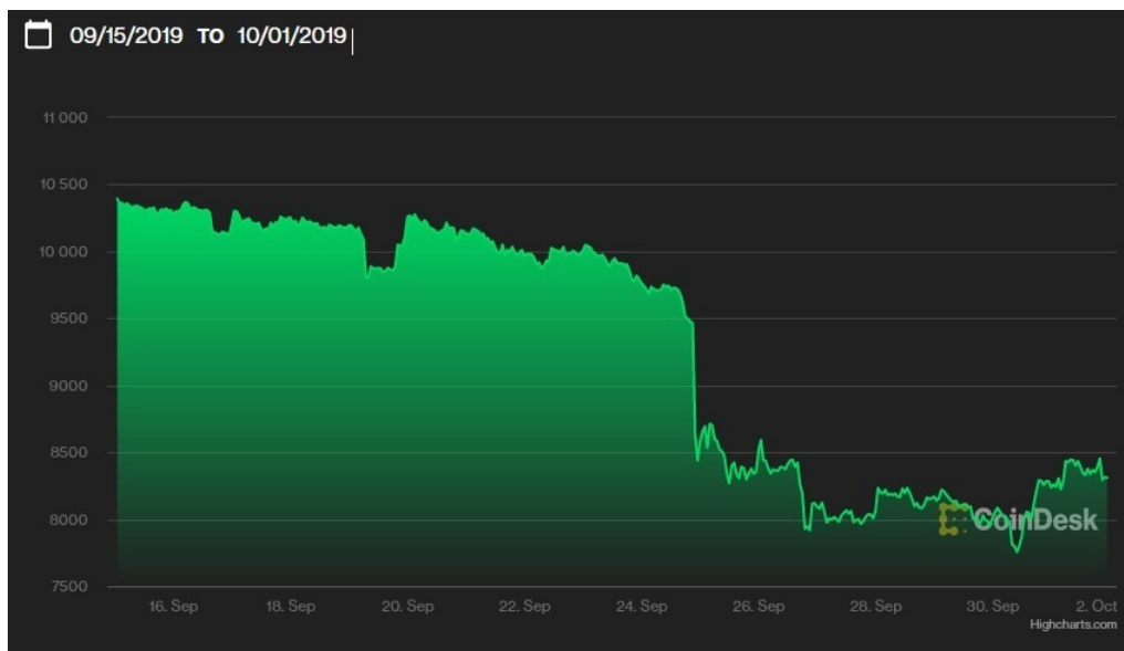
Figure 1: The price of bitcoin in USD in a period of 4 weeks around 9/23/2019.

impact; for example, following the media attention surrounding the leaking of the supremacy claims around September 22, 2019, the value of bitcoin (and other digital currencies) sharply dropped by more than 10% and it is a reasonable possibility that given the potential effects of quantum computers on the safety of digital currencies, the quantum supremacy claims caused this drop.